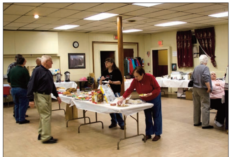
A festive table at this year's Christmas Party.