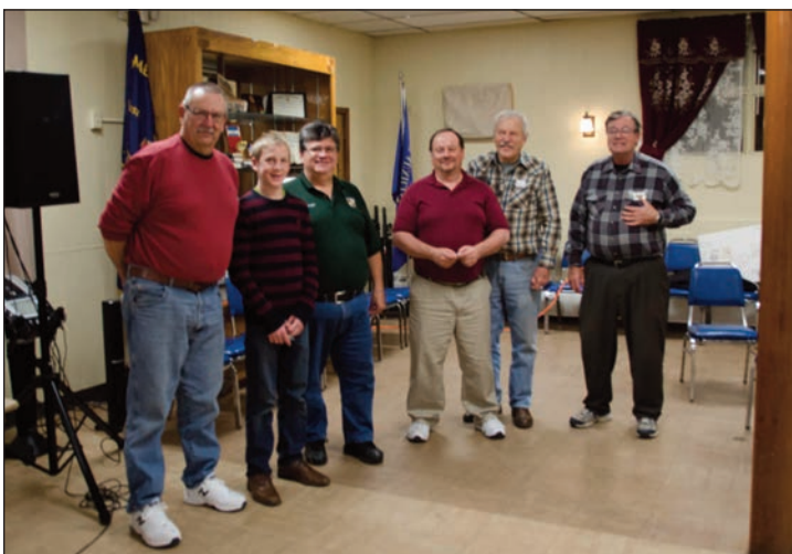
Earning their wings